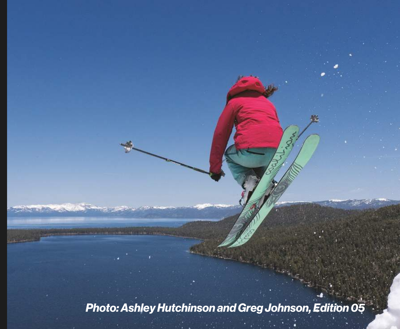
Edition 05