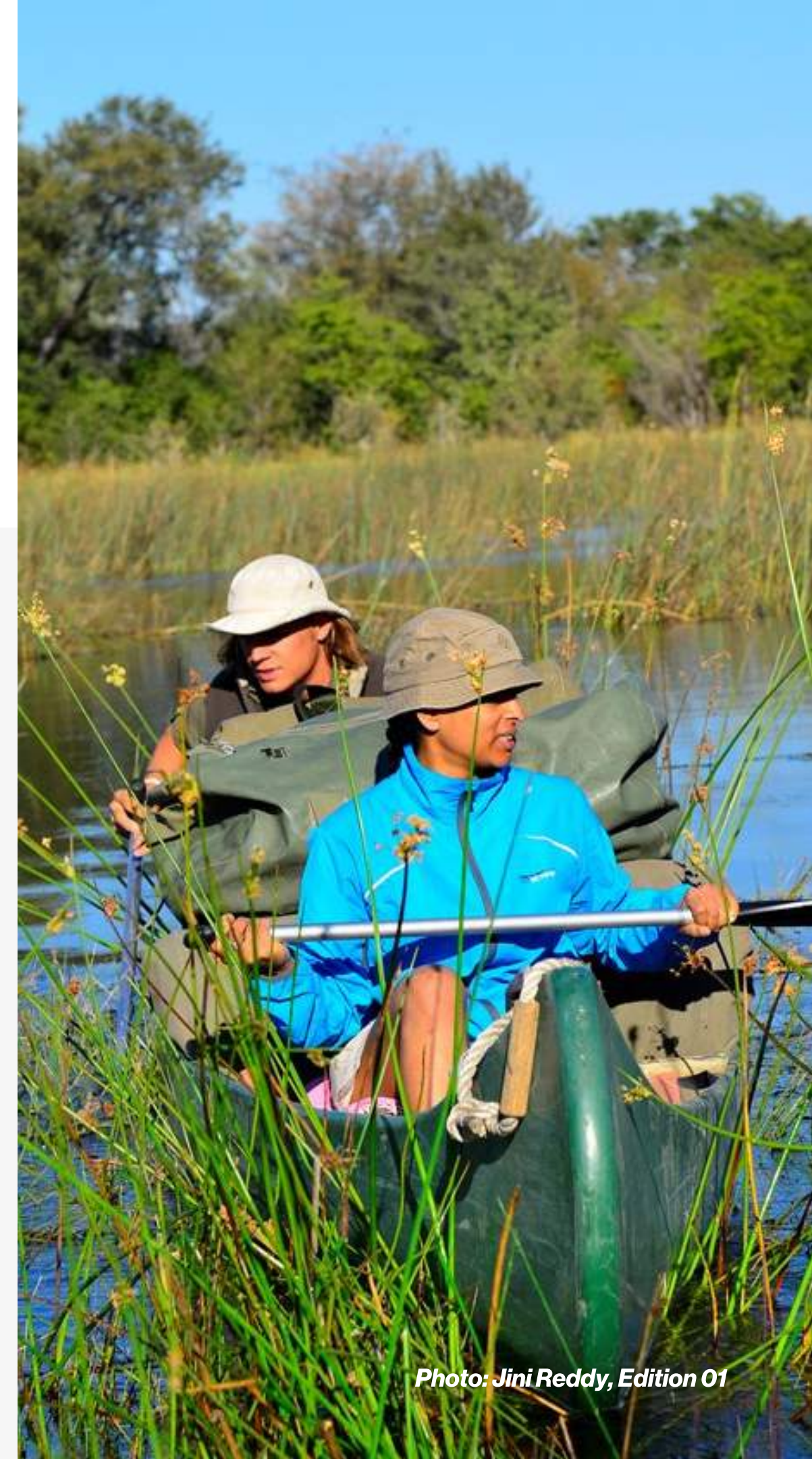
Edition 01

Together this work highlights issues, advocates for action and change and champions those leading the way - all crucial tasks if adventure, in its myriad forms, is to be a powerful force for good. But providing a space isn't enough. That space must be truly sustainable and empower the people involved.