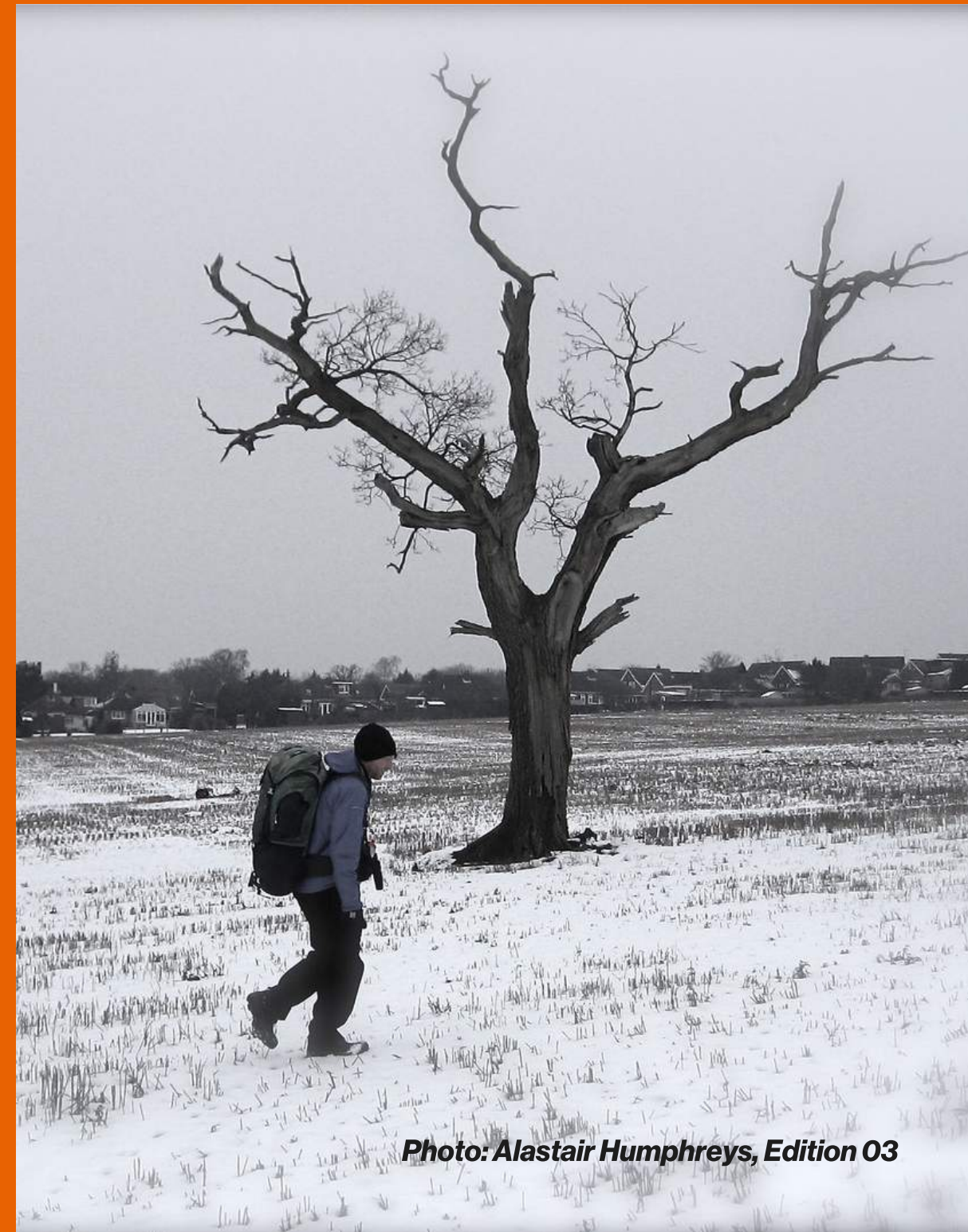
Edition 03

We are excited to announce that in 2021 it will change, through a range of revenue streams we will be transparently reporting on throughout the year. Patreon, a platform that will allow you to support us through recurring monthly payments, will be one of these streams.