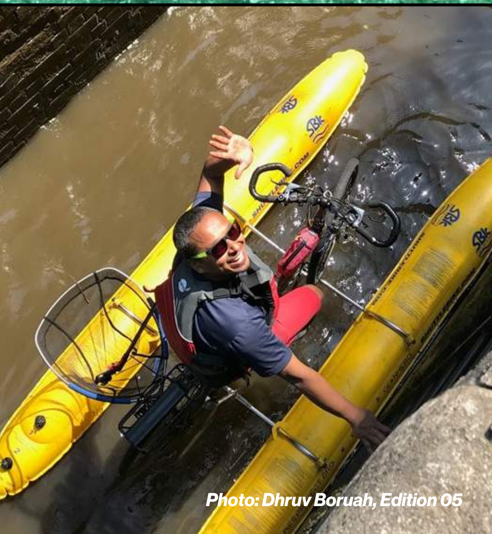
Edition 05