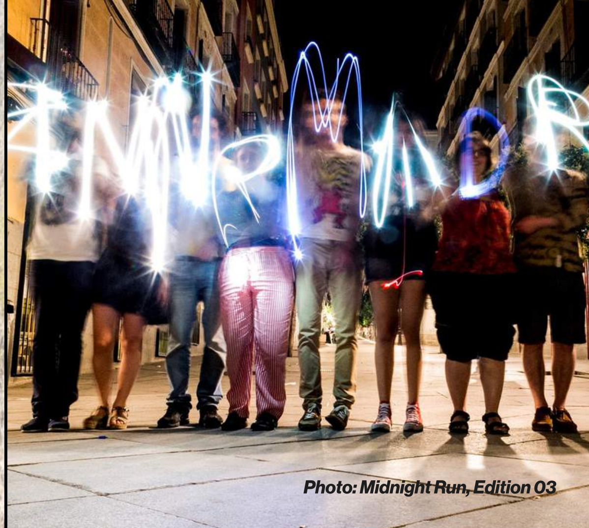
Photo: Midnight Run, Edition 03