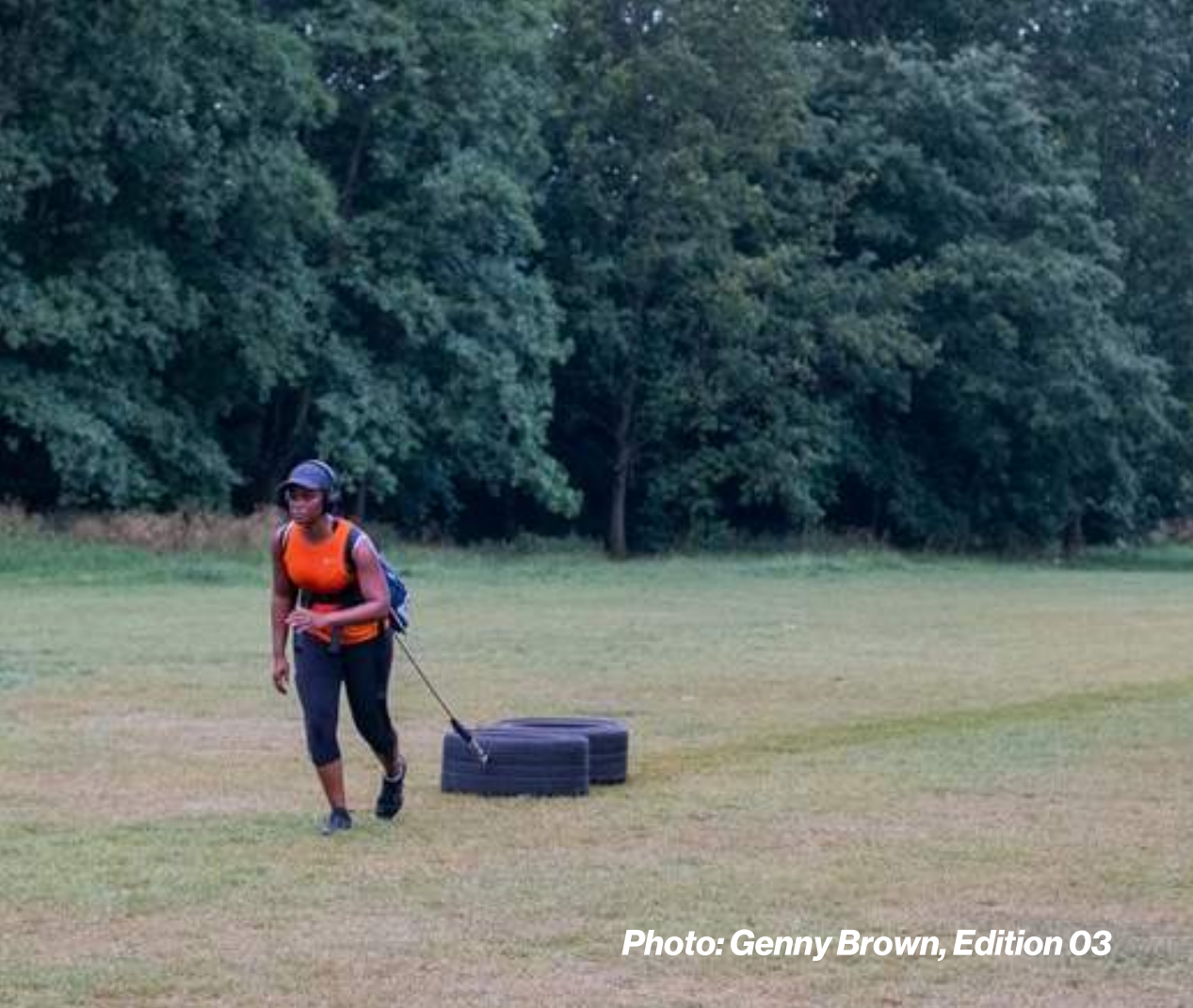
Edition 03