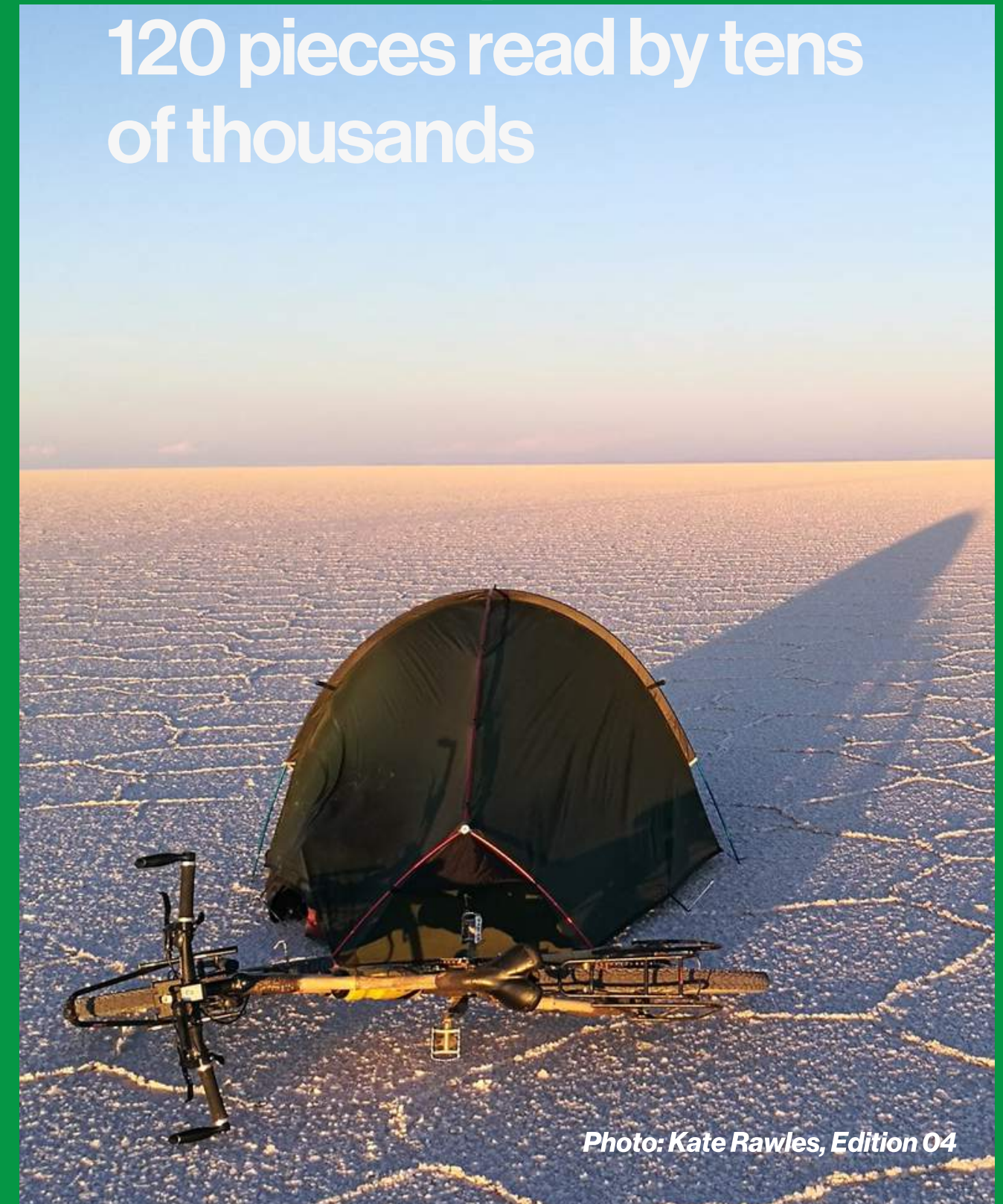
Edition 04

In 2020 we published 120 pieces read by tens of thousands