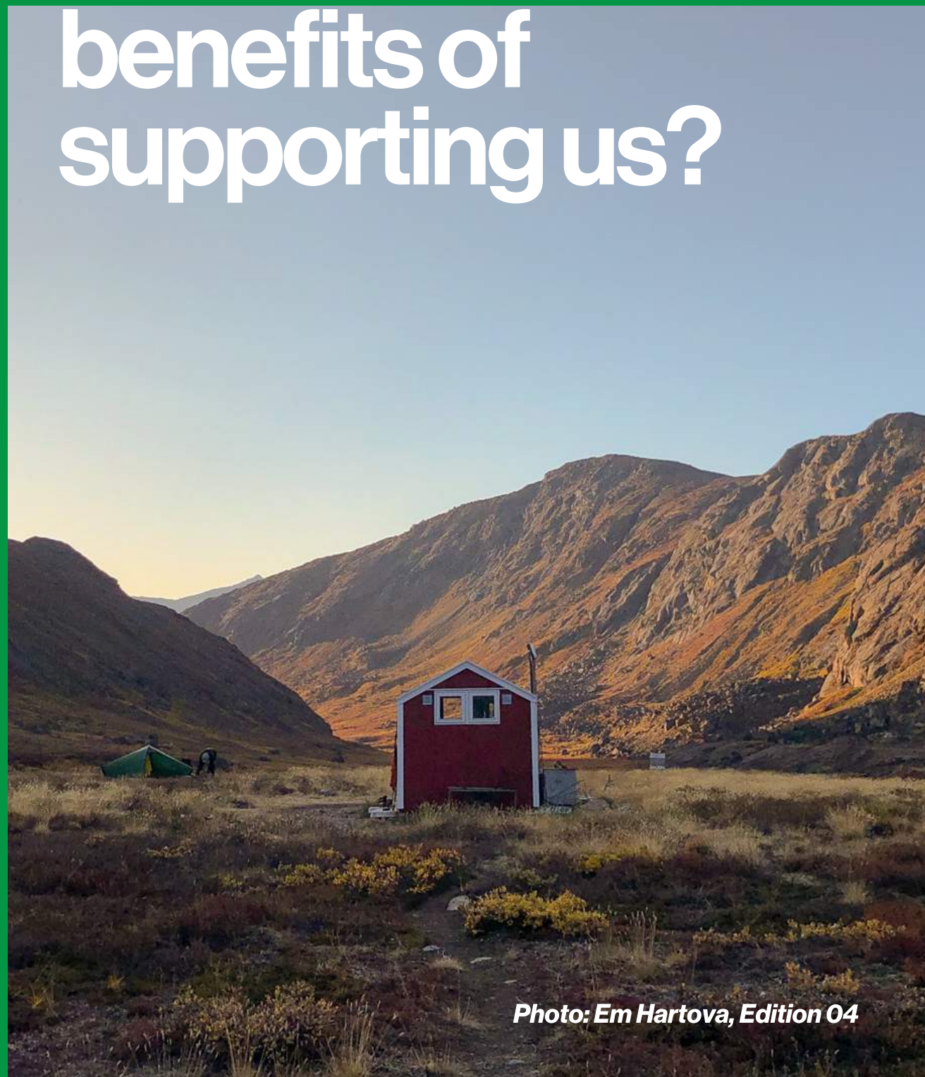
Edition 04