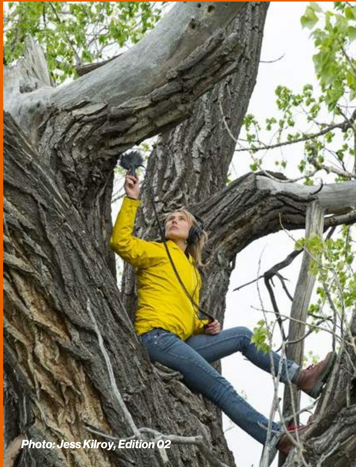
Edition 02