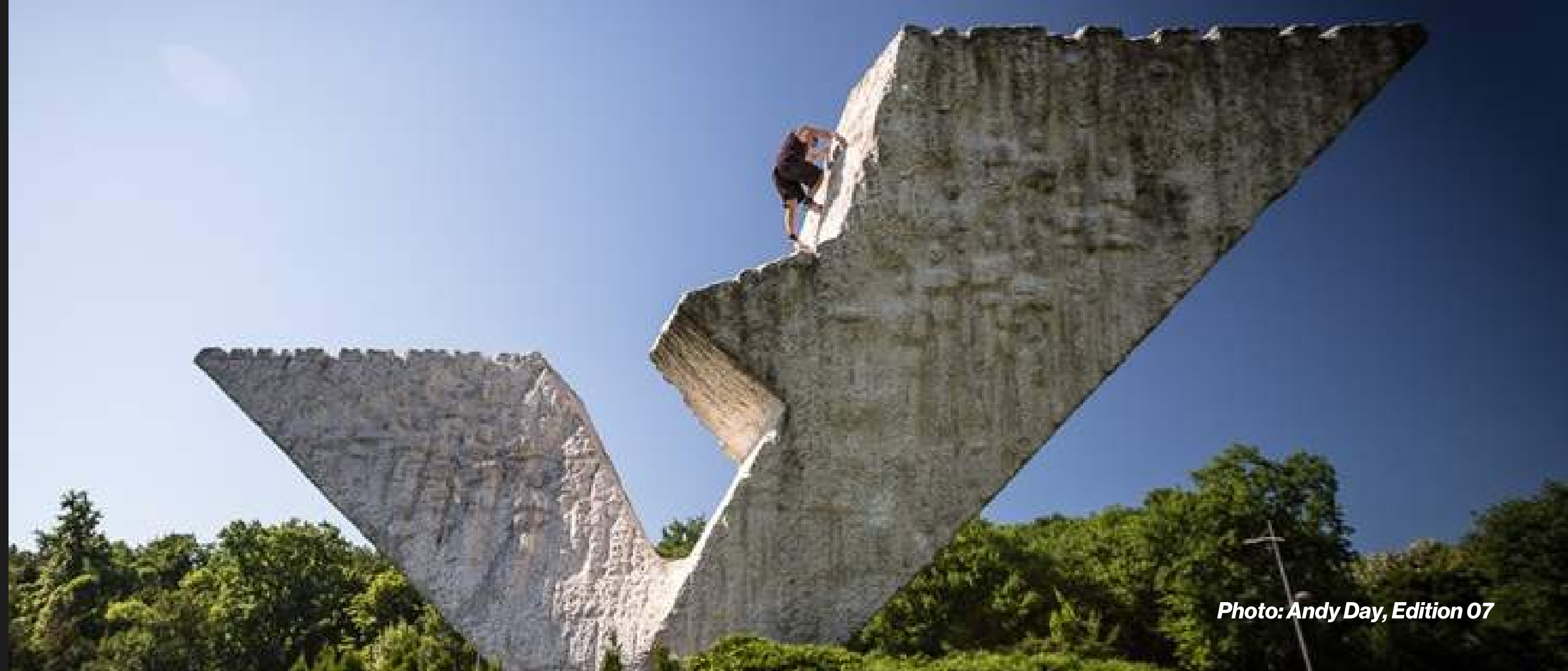
Edition 07

Transparency is vital to us, so we explain this in full on our website . If you're interested in supporting us, the process is simple...